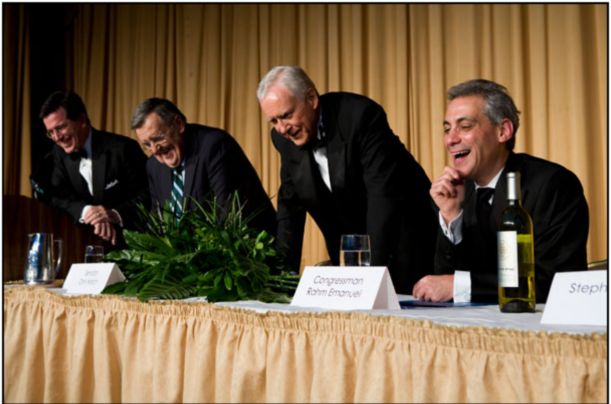
Stephen Colbert, Mark Shields, Orrin Hatch and Rahm Emanuel.